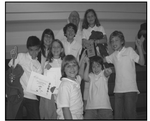
SNAMRR17 team at Regional competition